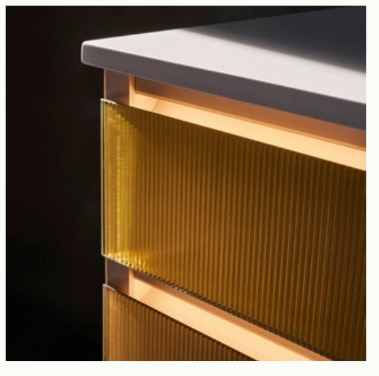
especially when they are seamless and out of sight.