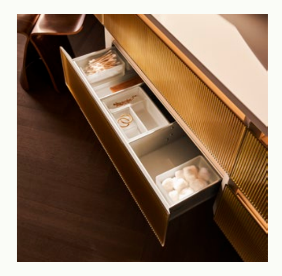
Amenities are indispensable,