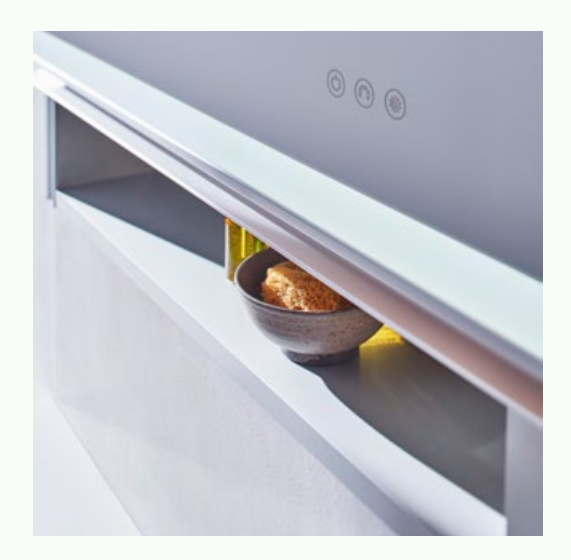
Technology is sexy.